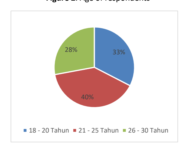
Figure 2. Age of respondents

Respondents who filled out the questionnaire of the survey expressed themselves up to 84% of women and 16% of male genres. Thus, the number of respondents who filled out questionnaires that had been distributed was more dominant in female genres than men.